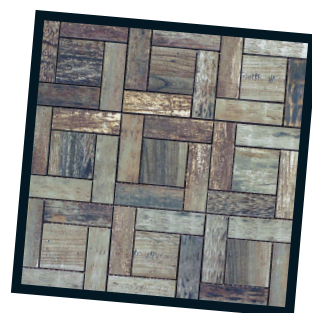
Courchevel Mosaic Street Tile, bakedtiles.co.uk

Cork is perfect for introducing texture. Its eco credentials, sustainability and warmth underfoot make it a great choice, plus it's inexpensive. Pure Tree and The Cork Flooring Company have lovely ranges that are easy to lay. The natural grain of wood also introduces texture and interesting formations, from herringbone to chevron to basket weave. Reclaimed parquet or floorboards are the dream (Bert & May have gorgeous options), and Quickstep have an engineered alternative to wood.